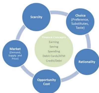
Figure 3. Economic Concepts controls Financial Concepts

economy. Good money management practice is a function of good decision making based on the understanding of scarcity, choice and opportunity cost.