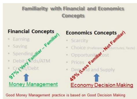
Figure 2. Familiarity with Concepts

On the aggregate, 97% of the students were Very Familiar or Familiar with the basic financial concepts as compared to 49% of the students who were Very Familiar or Familiar with basic economic concepts (Figure 2).