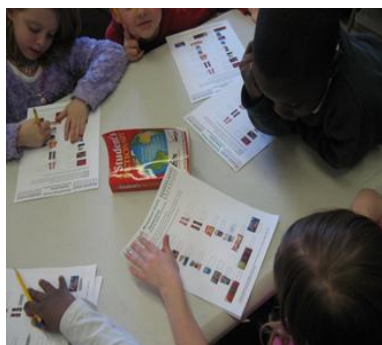
Figure 9. Students Practice as Consumers

This consumer activity always creates pricing confusion to students. This is because students recall that they were previously selling the same items, as suppliers at a higher price than they themselves are will to pay as consumers. Educator facilitates the process by explaining to students that these are all money management decisions that both suppliers and consumers encounter in the market and everyday activities. Consumers are always willing to buy at the lowest price, while suppliers are always willing to sell at the highest price.