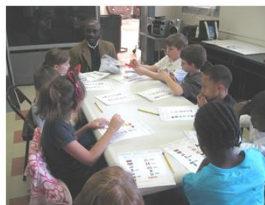
Figure 8. Educator and 4th grade students

Earning money is a good thing. Most children earn money (allowance) by completing chores or from garage sales or selling lemonade on a lemonade stand.