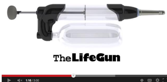
Figure 5. LifeGun video

Link to Video: http://youtu.be/K0WROOr01_Y