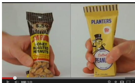
Figure 2. Planters packaging's video

Link to Video: http://youtu.be/mqKoQ8Mvhy0