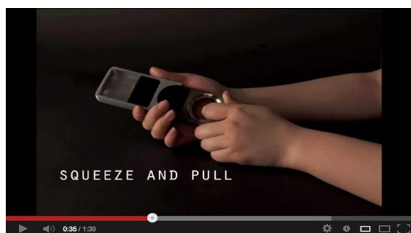
Figure 1. Revolve phone's video.

Link to Video: http://youtu.be/aP6ybB2KNI0