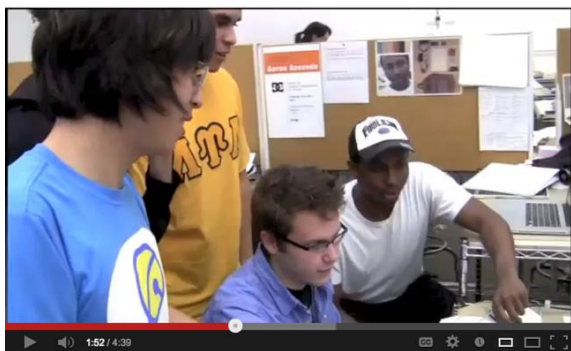
Figure 4: Squat sanitation system's video.

Link to Video: http://youtu.be/g7q-yzozJH0