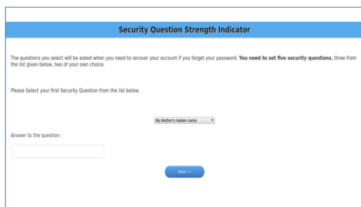
Figure. 1. Security Question Interface