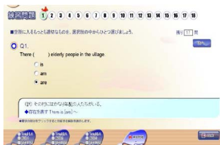
Figure 2. English Grammar Course, “Practice Questions” of Level 2-201 (from NetAcademy2)

When completing the English Grammar Course homework assignments, students first read the grammar explanation, then worked through the “Trial Questions” and “Practice Questions” by clicking. After studying the grammar on the screen, they copied all the sentences from the “Practice Questions” into their notebook, and handed it to the teacher in the next class.