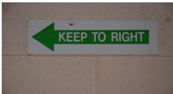
Figure 5. School signage in the research school