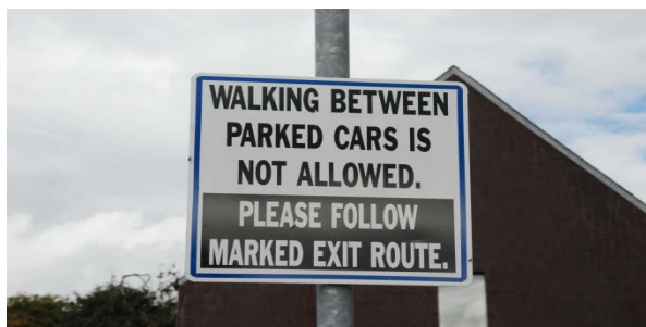
Figure 6. School signage in the car park area of the research school

The visual cultural inventories of the school and the homes are noticeably different in terms of the ordered bounded spaces in the school projecting a specific system of values in comparison with the free, unbounded, somewhat unordered living spaces of the homes also projecting family values demonstrates two separate cultures. These two cultures are however inextricably linked as students have to manage moving from the home spaces of freedom and expression to the school culture of rules and regulations. Central to this link is however the innate family culture and associated values that are moulded, mentored and modelled in the school setting. It is the merge of both cultures that coincide to further a single culture promoting educational attainment and progression of families and thereafter reproducing the social order.