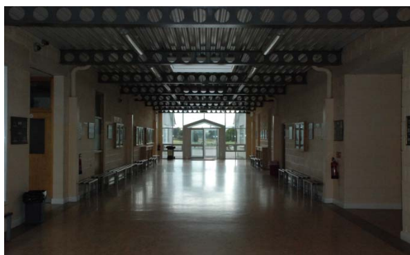
Figure 4. School corridor and open space in research school