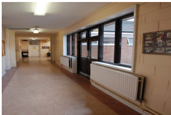
Figure 3. School corridor in research school