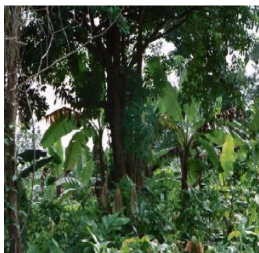
Figure 1. Plate 1 showing Agroforestry plot in one of the adopted villages

Biodiversity is the term used to describe life on earth - the variety of living things, the places they inhabit and the interactions between them. These interactions provide us with a number of essential natural services ("ecosystem services") - such as food production, soil fertility, climate regulation, carbon storage - that are the foundation of human well-being. The biological complexity of the world is continually changing as evolution gives rise to new species. However, uncontrolled exploitation, consumption of natural resources and habitat destruction for agriculture, urbanization and industrialization are degrading the environment which results into loss of biodiversity [12].