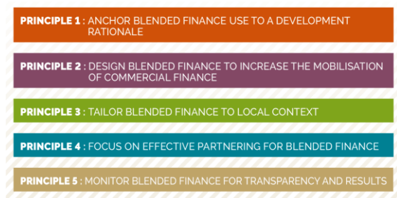
Figure 2. OECD/DAC Principles

One of the most significant discussions on anchoring BF on the local context is the one provided by the OECD/DAC Principles (see Figure 2). It set a policy tone for all financial stakeholders providing development financing, including but not limited to donor governments, development cooperation agencies, philanthropies, local capital structures, and concerned stakeholders. [9]. The debate about anchoring BF on the local context has gained fresh prominence, with many arguing that interventions from Development Finance Institutions (DFIs) and Multi-Lateral Development Banks (MDBs) should contribute to fostering local institutions. However, the local dimension remains the most significant challenge for financial actors.