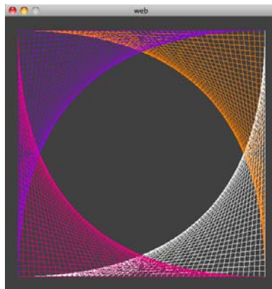
Figure 1. Pretty Web